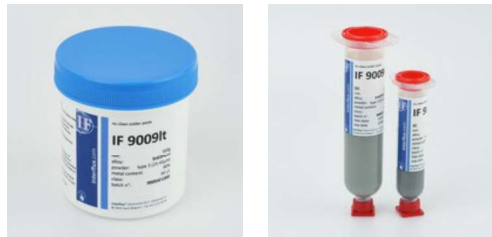
Products pictured may differ from the product delivered

IF 9009lt SnPb(Ag) is classified as RE L1 according IPC and EN standards.