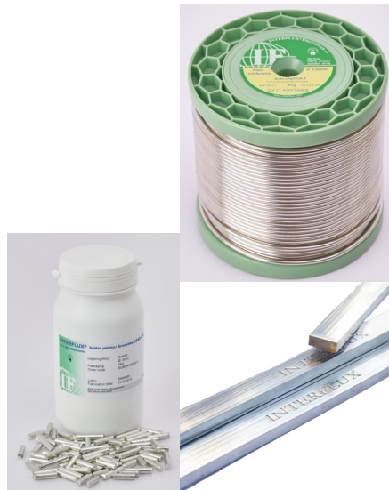
Products pictured may differ from the product delivered

Sn99Q is an alloy intended for rework of LMPA-Q solder joints in form of a solder wire. It is also available as an alloy in