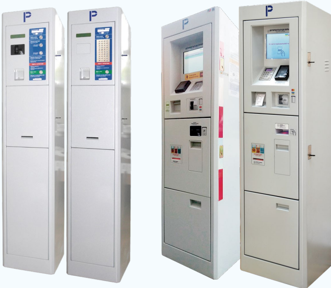
«SEA AP 100.04», «SEA AP 100.10»