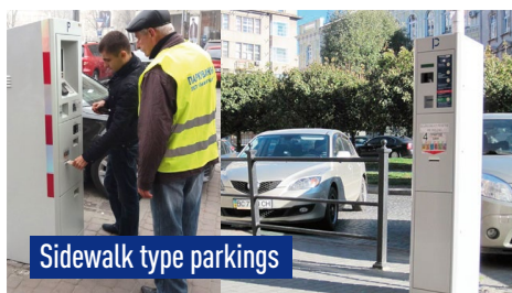
Sidewalk type parkings

SEA offers automated parking systems for organization of paid parkings of any type of complexity on "turnkey" basis, based on self-produced equipment as well as software of own development.