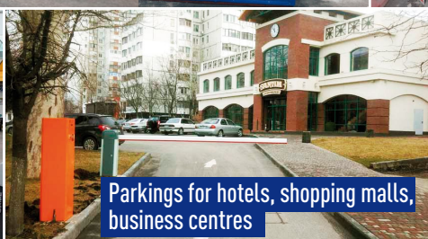
Parkings for hotels, shopping malls, business centres