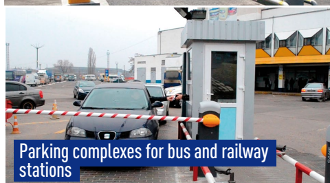
Parking complexes for bus and railway stations