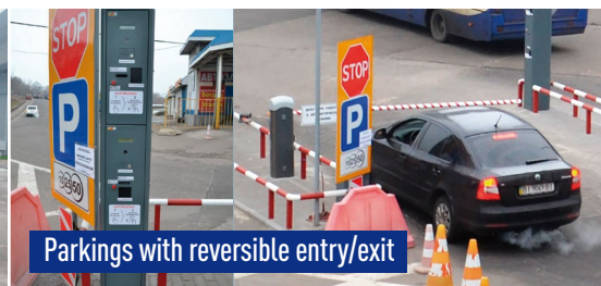
Parkings with reversible entry/exit