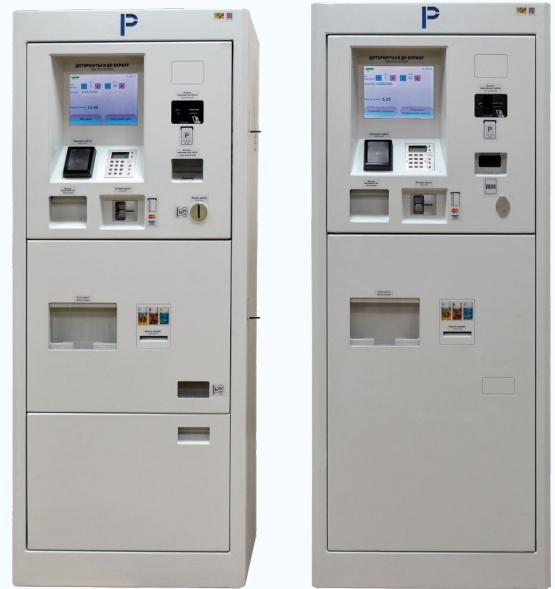
«SEA AP 100.33», «SEA AP 100.34»

«SEA AP 100.04» — Parking cost payment acceptance is performed by means of notes with exact fair only. Mentioned model is equipped with contactless parking cards reader and GSM radio channel module.