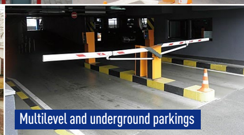
Multilevel and underground parkings