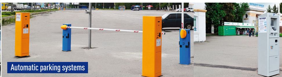
Automatic parking systems