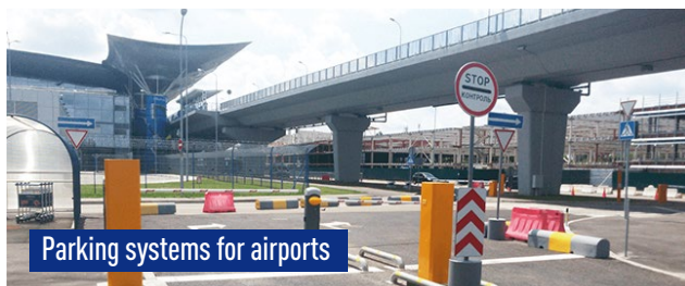
Parking systems for airports