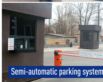
Semi-automatic parking systems with parking operator