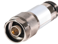
CASE STYLE: FF779