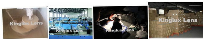
polishing USC inspecting packing warehouse