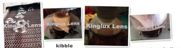
annealing heat treatment kibble Round Edge accurate grinding