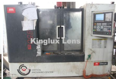
CNC machining center