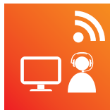
Communication & Management