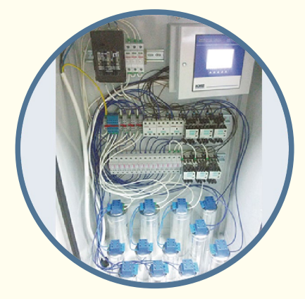
Reactive strength compensation cabinet for street lighting networks

SEA Company proposes an innovative (singular) dispatching remote control system composed of three modules for managing and monitoring road traffic, traffic lights and city outdoor lighting.