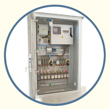
Cabinet "I-710" at the system start-up post with inbuilt lights managing terminal