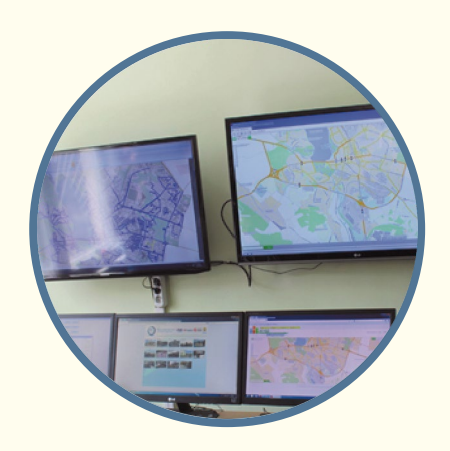
Dispatcher center (server with mnemonic) + Monitoring and control system software